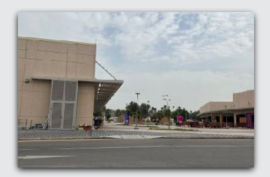
A new not-so-mini mart? Yeah, down by DHS is a new center. Groceries, Gym, pool, mosque, weird local fast food, and plenty of parking.